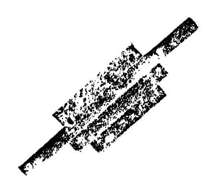
By WILLIAM C. BAGLEY